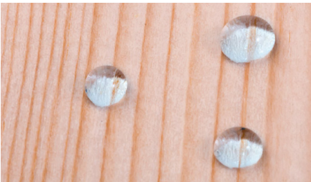
Wood treated with WOODSEAL PRO